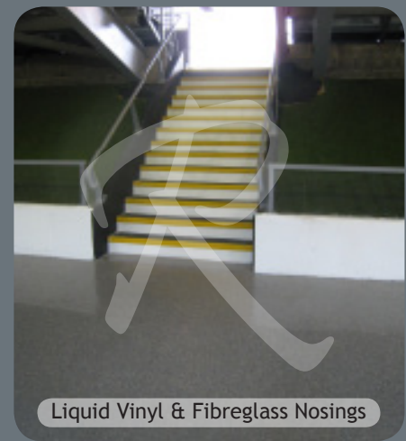
Liquid Vinyl & Fibreglass Nosings

Craven Cottage is the name of a sports stadium in the Hammersmith and Fulham area that has been the home ground of the association football team Fulham F.C. since 1896. The Stadium is located next to Bishops Park on the banks of the River Thames.